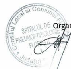
Organigrama Spitalului de Pneumoftziologie Floresti